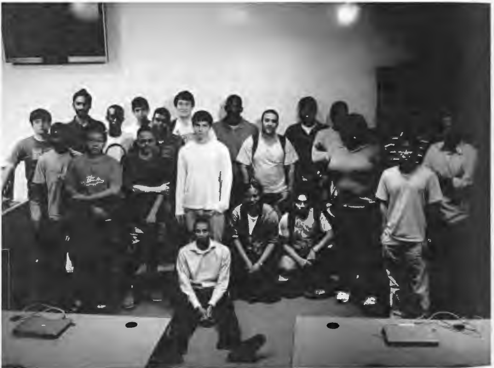
FIGURE 1. The Fall 2010 eStadium VIP team. They design, develop, and deploy systems that enable studies of wireless network traffic during football games. Fans in the stands go to: http://estadium.gatech.edu/iphone to access stats and on-demand video clips of plays for GT football games. Students from CEE, ECE, CS, and ISyE participate in the team. They also design social network apps and wireless sensor networks.